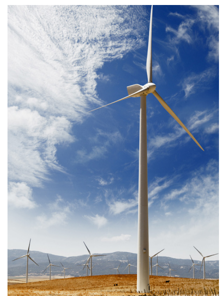
Wind turbines are painted a very light gray-white to better blend into the landscape, yet remain visible to aircraft.

the wind's energy. Aerodynamically designed blades are up to 265 feet long. As wind spins the blades, they power a generator that converts the wind's energy into clean electricity that can be transmitted to utility customers. Because of their locations, the vast majority of the project's wind turbines will not be visible from public access points in Carbon County.